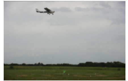
Picture of one of our contestants, N733CP in a Kramer/Noel Fly-in and Bombing Competition held at Coulter Field.